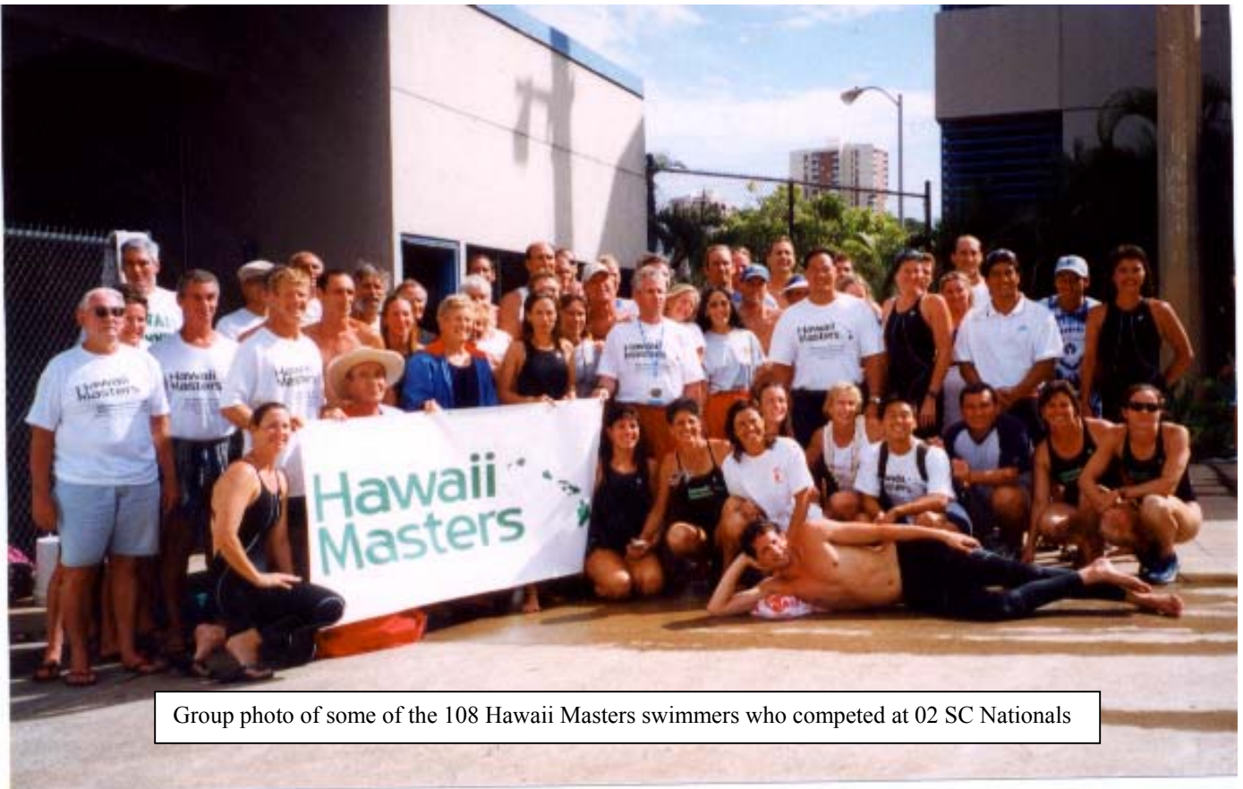
Group photo of some of the 108 Hawaii Masters swimmers who competed at 02 SC Nationals