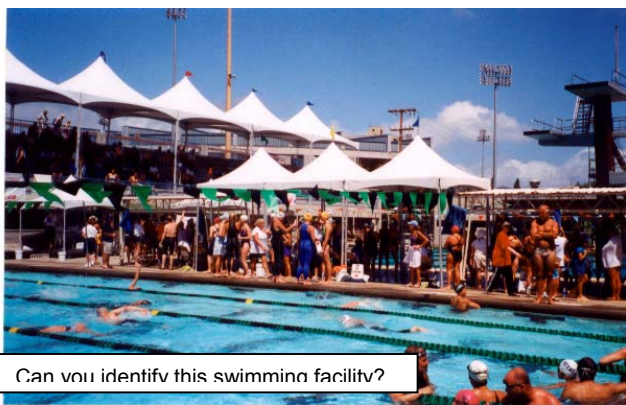
Can you identify this swimming facility?

Mailing Address Street Number and Name City, State 98765-4321